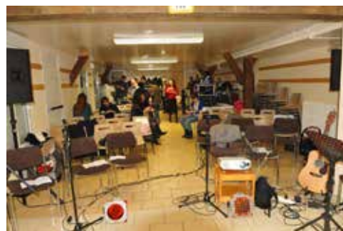
2013 : preparations for the Christmas celebration in Aubevoye