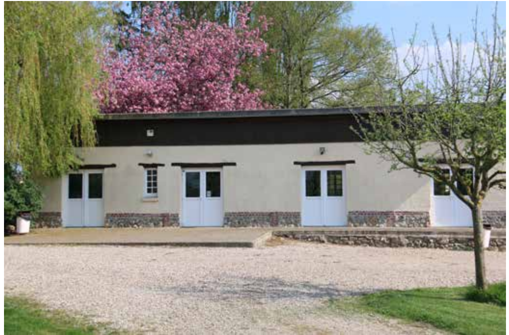
2019 : our church in Corny

After the official creation of the EPEPE in 2012, we felt the need to meet in a more accessible environment. We found a place also linked to the Catholic Parish, in Aubevoye this time. We decided to