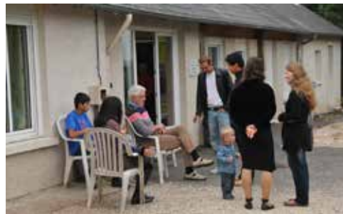
2011 : presbytery of Aubevoye

The first milestone of this new project was to find a more permanent place to stay, a home base to foster enduring relationships in the region. We decided to rent a building in Corny, a small village near Les Andelys. The building, in which the main room allows us to welcome up to 100 people, is surrounded by large gardens so that the location is ideal for children. We have already organized various meetings there: not only worship services, but also gatherings dedicated to children or festive meals such as “Le Noël du Coeur”.